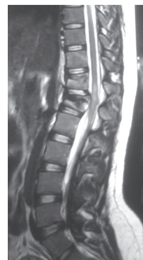
Fig. 1: Sagittal T2 weighted MRI image showing anterior wedging of D11 and D12 vertebrae, with heterogeneous signal intensity. Wedging is more pronounced in D12 vertebrae with convex posterior bulge causing severe anterior thecal sac narrowing and cord indentation, terminal spinal cord at this level is showing T2 hyperintensities suggestive of cord edema.

or bowel, bladder disturbances. There was no history of vomiting, seizures or ear, nose, throat (ENT) bleed. There was history of 12 weeks of amenorrhea. She underwent a lower segment cesarian section two years back and had one healthy male child. Her general and systemic examination was unremarkable. She was conscious, alert and oriented to time place and person. Motor and sensory examination were normal. Deep and superficial reflexes were normally present. Local examination revealed tenderness over dorso-lumbar spinal region. Ultrasound of the abdomen showed was normal and showed a live fetus with good cardiac activity. Magnetic resonance imaging (MRI) was performed, and it showed anterior wedging of D11 and D12 vertebrae, with heterogeneous signal intensity. Wedging is more pronounced in D12 vertebrae with convex posterior bulge causing severe anterior thecal sac narrowing and cord indentation, terminal spinal cord at this level is showing T2 hyperintensities suggestive of cord edema (Fig. 1). In view of the spinal instability the patient was planned for spinal stabilization and counseled accordingly. She underwent a posterior approach and D11-L1 pedicle screws and rod fixation (Fig. 2). She was exposed to minimum possible radiation, and a lead shield cover was provided to protect the fetus. The patient recovered well without any residual neurological deficits