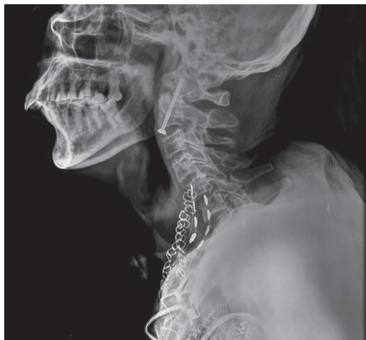
Fig. 2: X-ray cervical spine lateral view showing ventral screw fixation of odontoid fracture and the electrodes placed over cervical part of phrenic nerve