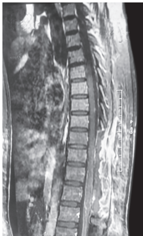
Fig. 4: Postoperative T1 + contrast MRI sagittal image