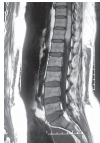
Fig. 1: T1-weighted MRI sagittal image

D10 to D12 laminectomy with preservation of facets was performed. The dura was opened in the midline. The cord appeared dilated with overlying engorged tortuous pial vessels. The lower pole of the lesion was appearing at the cauda conus junction. During dissection under microscope, accidentally the tumor was punctured and the hemorrhagic fluid drained. After midline myelotomy at the D10 level, a dark red soft mass was detected. Despite a well-defined border, the tumor was adhesive