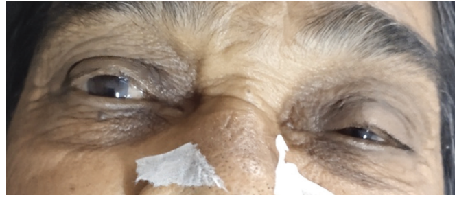
Fig. 3: Horner's syndrome

Efficacy of the block varies from person to person with some showing response with single injection while some require up to