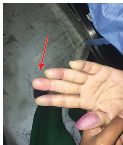
Fig. 1: Hand showing Raynaud's disease

Post procedure, the patient was monitored for 2 hours. Horner's syndrome noted to confirm the block as shown in Figure 3. The patient had NRS score of 3 after 24 hours with slight improvement in color.