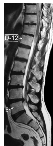
Fig. 1: Magnetic resonance imaging showing herniated intervertebral disk: sagittal view

Reflexes were normal. The straight leg rising (SLR) test was negative on both sides. On spine examination, there was no axial or paramedian tenderness.