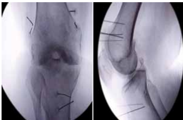
Fig. 3: Fluoroscopic image of bipolar RF needle placement

inability) and VAS (0 = no pain, 10 = worst pain) before and after the procedure at day-1, day-7, and at every month till 6 months (Table 1).