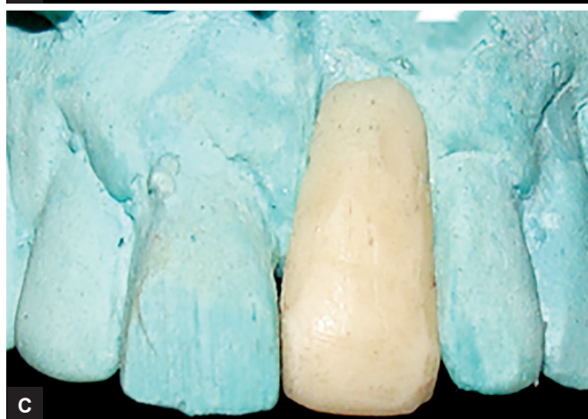
Figs 2A to C: (A) Labially misplaced implant, (B) cast scraping procedure, and (C) provisional restoration