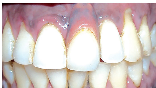
Fig. 4: Final restoration

repeated at a regular interval to create emergence profile surrounding the implant. The patient was recalled after 1, 3, and 6 months regularly to check the position of gingiva. After creating the emergence profile, final impression was made and metal coping was fabricated (Figs 3A and B). Shade selection was done and gingival porcelain was added to give esthetics to final restoration (Fig. 4).