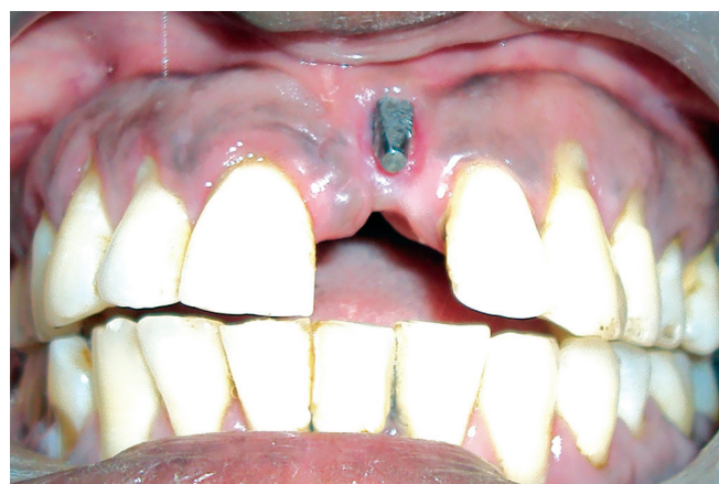
Fig. 1: Labially misplaced implant