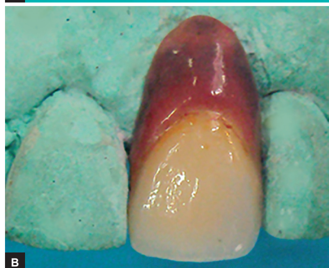
Figs 3A and B: (A) Metal tryin, and (B) characterization using gingival porcelain