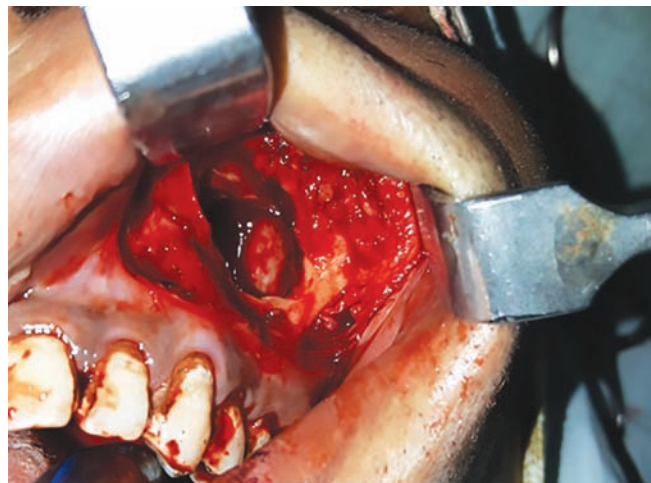
Fig. 3: Maxillary antrum after foreign body removal