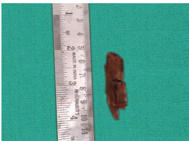
Fig. 4: Foreign body (wooden piece)