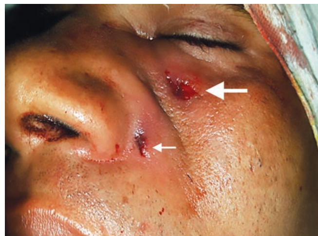
Fig. 1: Fistulous opening on the left side of face

Anterior rhinoscopy showed left side deviated nasal septum with congested and edematous nasal mucosa. Routine hematological investigation was normal. Computed tomography scan revealed bony defect of the anterior wall of left maxillary antrum with heterogeneously hyperdense lesion of the maxillary antrum extending to left nasolabial fold suggestive of inflammatory with possibility of fungal element. Based on history, examination, and investigations, provisional diagnosis of osteomyelitis was made. As patient was continuously under conservative treatment without significant improvement, it was decided for proper debridement under general anesthesia. Maxillary antrum was opened using Caldwell–Luc approach (Fig. 2).