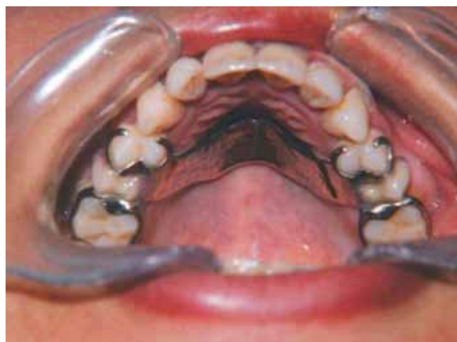
Fig. 2: Upper partial denture with cobalt-chromium clasps in patient's mouth