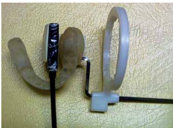
Fig. 6: The radiographic template with the Rinn XCP bite block and film holder carrying the sensor chip

used for assessing the mesial and the distal marginal bone height around the anterior and the posterior maxillary partial denture abutments. Parallel lines to the long axis of the mesial and the distal surfaces of each abutment were made. At each site the evaluation was made by measuring the distance in mm from the crest of the alveolar bone to the apex of the tooth. The changes in the bone height in the subsequent measurements were calculated. The mean changes of the mesial and distal bone heights of the premolars and molars were considered as the bone changes of that patient. The software of the Digora system was used for evaluation of the changes in the bone density mesially and distally to the anterior and the posterior maxillary partial denture abutments. This was done by making a line on the mesial and a line on the distal surfaces of each maxillary partial denture abutment. The line extended from the crest of the alveolar ridge to the apex of the tooth and passed adjacent to the space of the lamina dura parallel to the surface of the root. The value indicating bone density along each line was recorded and the mean value of all abutments readings was calculated (Figs 6 to 8).