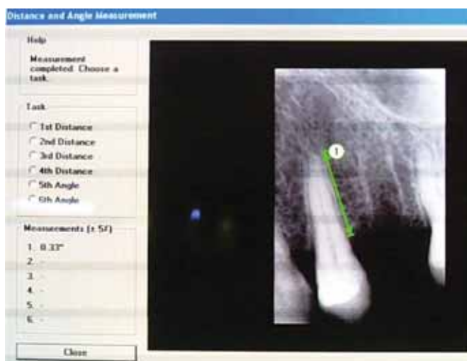
Fig. 7: Linear measurements of the alveolar bone height with the Digora software