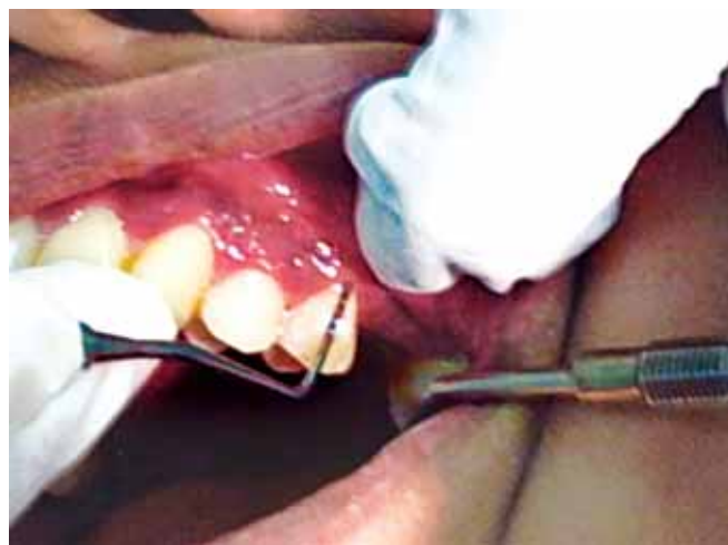
Fig. 5: Measuring of the epithelial attachment loss

Charged-coupled device system (RVJ – AET, ARDET, s.r.i., Milano, Italy) consisted of an electronic chip used as a sensor for the radiation with a cable connected the sensor to the computer and the image was displayed immediately on the computer monitor after exposure, Orix X-ray machine (Orix – AET, ARDET, s.r.i., Milano, Italy), Rinn XCP periapical film holder (Rinn Corporation, XCP instrument, USA), and an individually constructed radiographic acrylic template were used for making standardized digital images for the anterior and posterior maxillary partial denture abutments following the long cone paralleling technique. 11 The template was designed to receive the Rinn XCP film holder in a position palatal to the anterior and posterior abutments and parallel to their long axes. The radiographic template with the bite block carrying the sensor chip was inserted in the patient's mouth. The bite block was assembled to the plastic aiming ring at the end of the cone by means of the indicator arm. The electronic sensor chip was exposed by the Orix X-ray machine at 65 kilovolt, 10 milliamperere for 0.2 second. The stored images of each patient were interpreted at the end of the follow-up period by one examiner at two different times to decrease intra- and interobserver errors and the means of the two trials were recorded. The linear measurement system supplied by the Digora software (Orion Corporation, Soredex, Finland) was