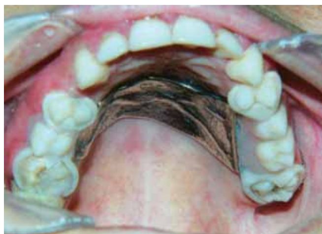
Fig. 1: Upper partial denture with acetal resin clasps in patient's mouth

Twenty patients 12 males and 8 females with Kennedy's class III modification I partially edentulous maxilla and dentulous mandible were selected for this study. The patients were divided into two equal groups. For the first group, the patients received maxillary partial denture with metallic cobalt-chromium frameworks and acetal resin clasps (Pressing di Monticelli Rag. Stefano – 47046 Misano Adriatico – Italy). For the second group, the patients received maxillary partial denture with metallic cobalt-chromium frameworks and cobalt-chromium clasps (METAPLUS VP – Germany). Maxillary premolar was used as anterior abutment and maxillary molar was used as posterior abutment on both sides for construction of maxillary removable partial denture (Figs 1 and 2). Clinical examination of the maxillary partial denture abutments showed that it was free from caries, gingival inflammation, periodontal pockets, and there was no tooth mobility. By X-ray evaluation the partial denture abutments were free from periapical or periodontal pathosis. The selected patients were free from systemic diseases that may affect the alveolar bone condition. Full mouth scaling and root planning were performed to all patients, and they were instructed for proper oral hygiene and