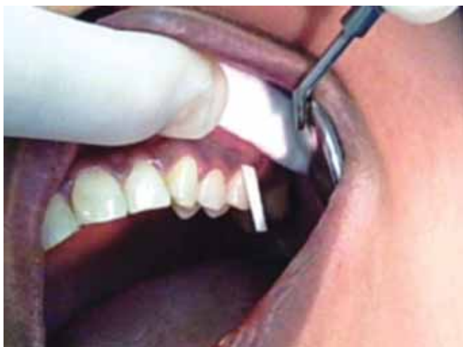
Fig. 3: Collection of the crevicular fluid sample

It was collected using Whatman filter papers number one. The filter papers were cut in strips of 3 mm width and 10 mm length. The area around each abutment was isolated by cotton rolls and dried gently by dry air. The strips were placed at the orifices of gingival crevices of buccal and palatal surfaces of the abutments and left in place for three minutes. The strips were removed and immediately inserted in 2% ninhydrin solution for 1 minute and kept to dry. 10 The areas of the strips which stained dark purple indicated the amount of the collected crevicular fluid. The surface area of the strip which stained dark purple was measured by using square millimeter graduated transparent paper superimposed over the stained filter paper. The stained area was traced on the graduated transparent paper and the number of the square millimeters was calculated and approximated to half square millimeter. The mean surface areas of the tested teeth were calculated and recorded (Figs 3 and 4).