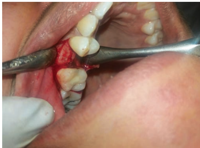
Fig. 3: Retraction