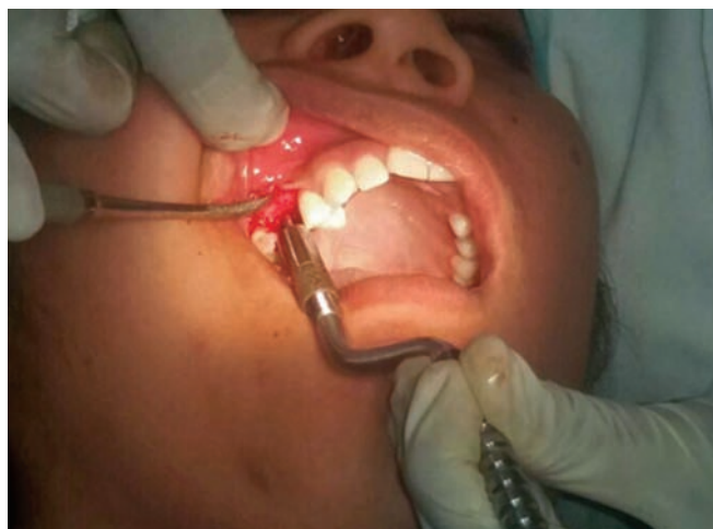
Fig. 5: Sinus lift instrumentation