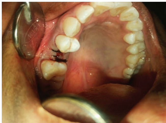
Fig. 7: Suturing