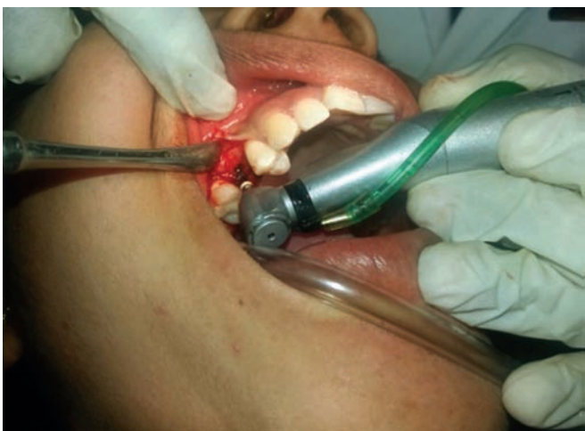
Fig. 4: Initial pilot drill