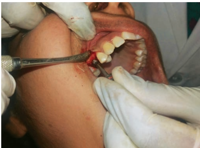
Fig. 6: Implant placement