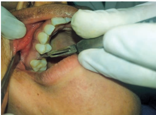
Fig. 2: Incision