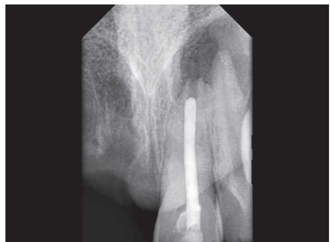
Fig. 3: Radiograph showing immediate obturation after placement of 3 mm apical barrier of calcium phosphate

Apexification is defined as "a method to induce a calcified barrier in a root with an open apex or the continued apical development of an incomplete root in teeth with necrotic