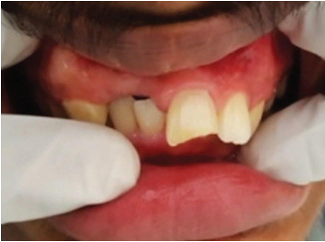
Fig. 1: Preoperative photograph