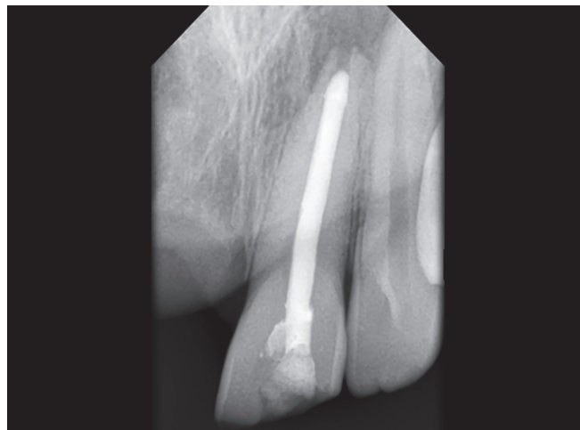
Fig. 4: Three months postoperative view

The cement powder was mixed with the distilled water supplied by the manufacturer to make a thick paste. The mix was rolled using the spatula since it had a better consistency compared to MTA and was placed in the root canal using pluggers to a thickness of 3 mm. He was recalled after 3 months and radiograph showed reduction in size of the periapical lesion with signs of apical healing (Fig. 4). The tooth was asymptomatic, nontender, and