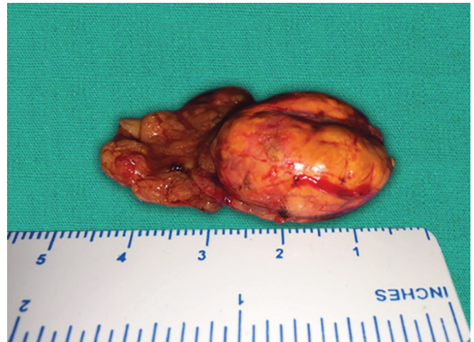
Fig. 2: Gross appearance of left adrenal gland with the mass after surgical removal

normal ejection fraction. Due to the persistent high blood pressure, the patient was referred to us for further evaluation. Based on her past history of hypokalemia, blood samples were sent for serum electrolytes, which showed serum sodium as 143 mEq/L and serum potassium as 2.3 mEq/L. Plasma aldosterone was high (582 pmol/mL) and plasma renin activity was low (0.17 ng/mL/hour). Due to the high aldosterone to renin ratio (3423 pmol/L:ng/mL/hour), primary hyperaldosteronism was suspected. Computed tomography (CT) of the abdomen revealed a well-defined hypodense lesion of size 25×16 mm in the left adrenal gland, which was most likely to be an adenoma (Fig. 1). After 3 to 4 weeks of medical treatment with spironolactone to normalize her potassium level, she underwent laparoscopic left adrenalectomy, which was successfully accomplished with an uneventful recovery (Fig. 2). After the 3rd postoperative day, plasma aldosterone levels were measured again and were 29.39 pmol/mL; further, plasma renin activity was 0.46 ng/mL/hour, sodium levels were normal, potassium levels were 3.8 mEq/L, and blood pressure was 110/80 mm Hg without any antihypertensive drugs. Adrenal specimen was proved to be adenoma by histopathology. She was normotensive without any antihypertensive drugs even at her follow-up visit after a month (Table 2).