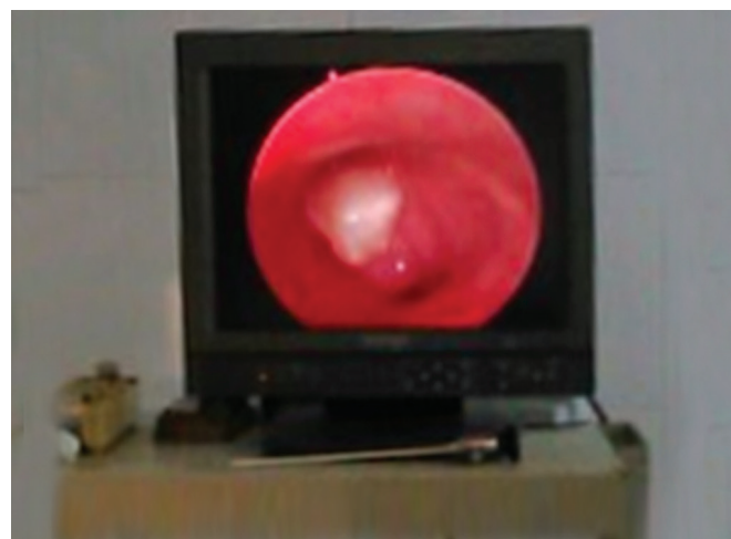
Fig. 2: Subglottic growth obstructing the lumen