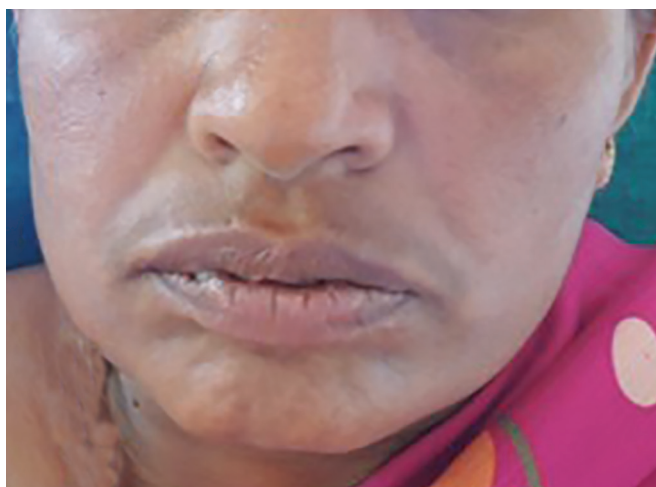
Fig. 1: Extraoral photograph