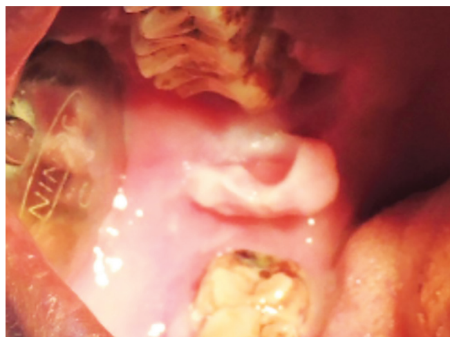
Fig. 2: Swelling on left buccal mucosa