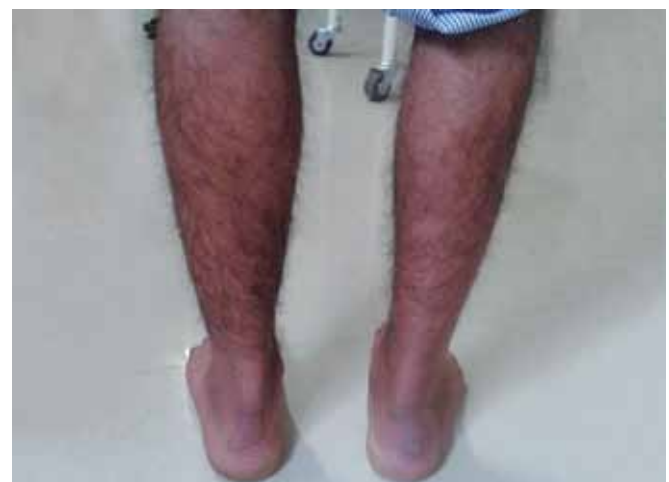
Fig. 2: Wasting of right leg