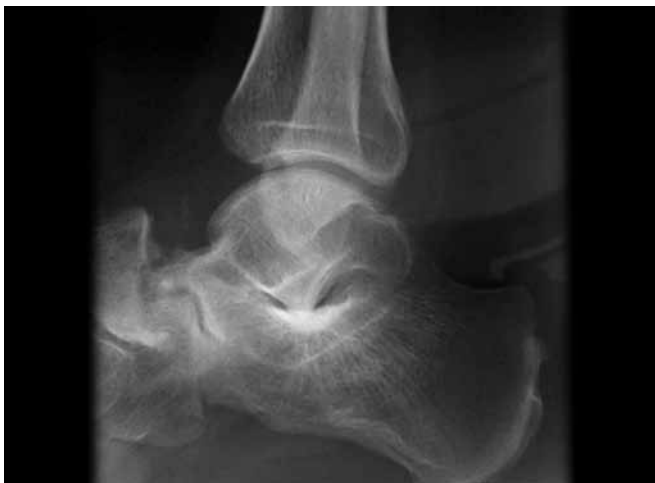
Fig. 3: Preoperative X-ray