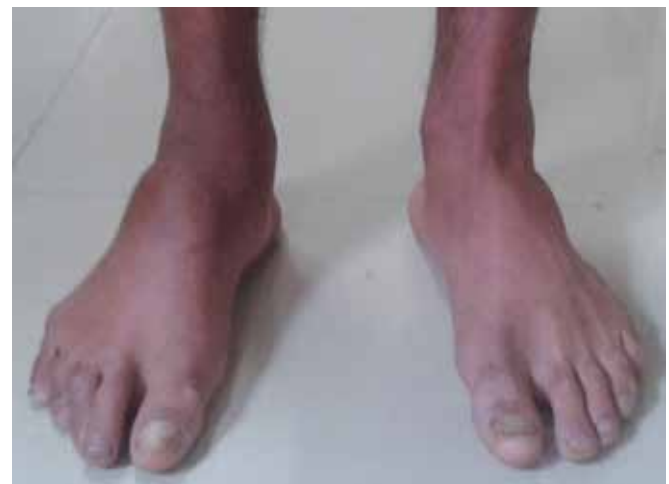
Fig. 1: Swelling dorsum of foot

he visited us. On physical examination, right foot had swelling on dorsum (Fig. 1) with wasting of right leg (Fig. 2). There was no redness, dilated veins, local rise of temperature and lymphadenopathy. Eversion and inversion movements were restricted and painful while dorsiflexion and plantar flexion were terminally painful but full range of movement was there. Laboratory findings demonstrated an erythrocyte sedimentation rate (ESR) of 20 mm during the first hour with normal complete blood counts (CBC) profile. Preoperative X-ray (Fig. 3) of the right foot showed gross talonavicular joint destruction with erosion of the navicular bone. Preoperative computed tomography (CT) scan (Fig. 4) was done, showing extensive navicular destruction with destruction of head of talus. A chest X-ray was normal and Montoux skin testing was negative. In light of raised