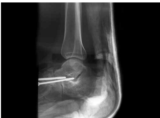
Fig. 5: Postoperative X-ray