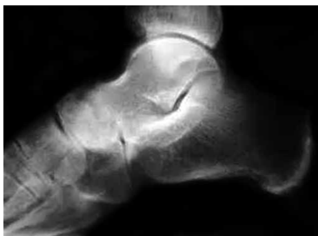
Fig. 6: Nine months follow-up

ESR and radiological findings, the patient was taken up for surgery as a diagnostic (biopsy of the lesion) as well as a therapeutic procedure in the form of talonavicular arthrodesis. Intraoperatively, crumbly grayish soft tissue around the talonavicular joint was seen which was entirely removed by curettage. Talonavicular arthrodesis was done using two partially threaded cancellous screws along with bone graft taken from ipsilateral proximal tibia, as seen in postoperative X-ray (Fig. 5). Below knee plaster splint was given for 4 weeks. Anti-tubercular treatment (four drugs regimen) was started soon after the diagnosis was confirmed on histopathological findings. Afterwards, a below knee POP cast was given allowing partial-weightbearing for one month followed by full weightbearing in the POP cast for another month. The screws were removed at a hospital (near place of residence of the patient) at 4 months, after radiological confirmation of talonavicular arthrodesis. The patient received a total 9 months of antituberculosis chemotherapy. At the end of 9 months follow-up (Fig. 6), patient was pain-free and having full-weightbearing on the involved foot.