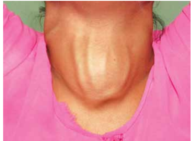
Fig. 2: After arm raising significant dilatation of neck veins (Positive Pemberton's Sign)

Two patients aged 36, 40-year-old female had neck mass for 5, 9 years respectively. Both had symptoms of compressive symptoms. On examination, there was multinodular goiter but lower margin was not palpable (Fig. 1). On Pemberton maneuver, there was dilatation of several neck veins and distress (Fig. 2). They were biochemically