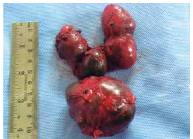
Fig. 4: Specimen