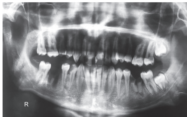
Fig. 2: Preoperative orthopantomogram