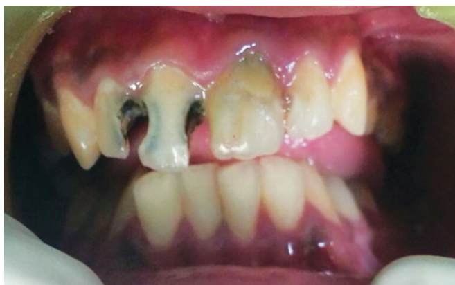
Fig. 1: Severely mutilated maxillary anterior teeth

Initially full mouth prophylaxis was carried out and the oral cavity was rinsed with 2% chlorhexidine. 11 After caries excavation, root canal treatment of six maxillary anterior teeth and tooth 44 were completed