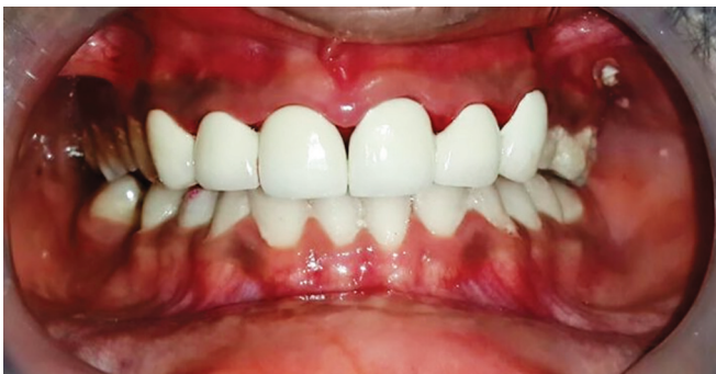
Fig. 4: Cementation of metal ceramic crowns