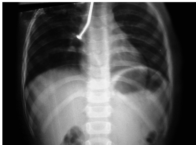
Fig. 2: X-ray chest (PA view) showing iron nail

mortality. 8 The severity of the symptoms depend upon the location, size, composition and the period for which the foreign body has been present. A variety of foreign bodies have been reported in the tracheobronchial tree. Food or food products are major airway foreign bodies, the reported incidence being as high as 70% of all foreign bodies. 9 Unusual foreign bodies like bubble gums, leech, broomstick, broken tracheostomy tube, etc. have also been reported. Long iron nail is very rarely reported in tracheobronchial tree as foreign body. It is necessary to screen and X-ray every patient who is admitted with a history of having swallowed a foreign body or patient who suddenly develops cough or dyspnea. 10 Foreign bodies always create temptation to remove immediately and land up in pushing the foreign object to the deeper area. The dictum while dealing with these foreign bodies is that one should not hurry to remove the foreign body unless proper illumination, instrumentation and expertise are available.