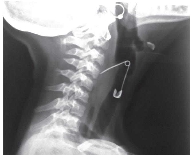
Fig. 1B: X-ray neck (lateral view) showing open safety pin

airways can present with varied symptomatology. Often history is not contributory and diagnosis depends on clinical suspicion, clinical signs and radiological findings.