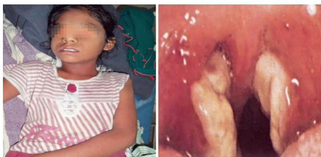
Fig. 1: Sunitha, 11-year-old female child, faucial diphtheria, grade 3 tonsils with pseudomembrane