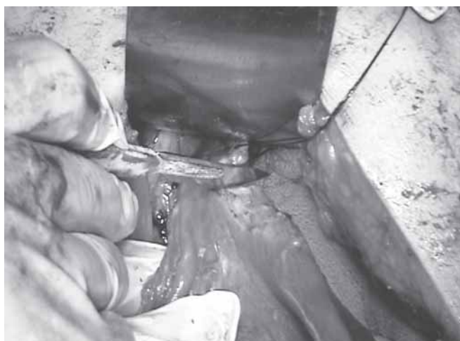
Fig. 4: Gastrectomy performed using knife at the esophago-gastric junction