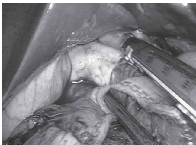
Fig. 2: Division of pylorus distal to prepyloric vein using linear cutter stapler