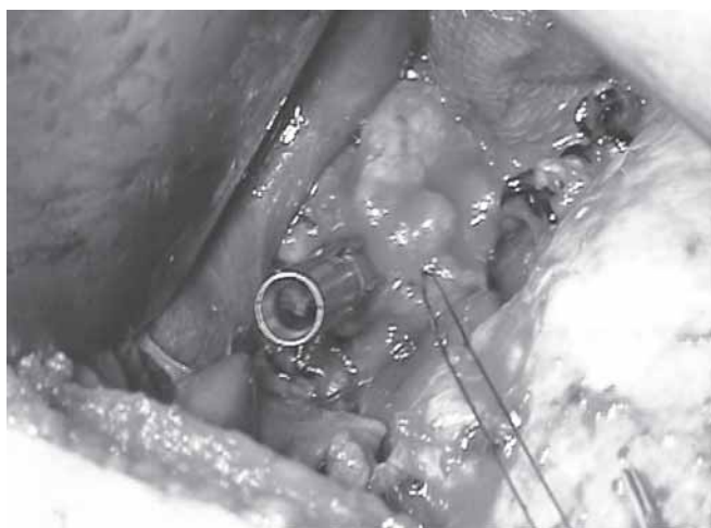
Fig. 5: Anvil placed into the esophagus