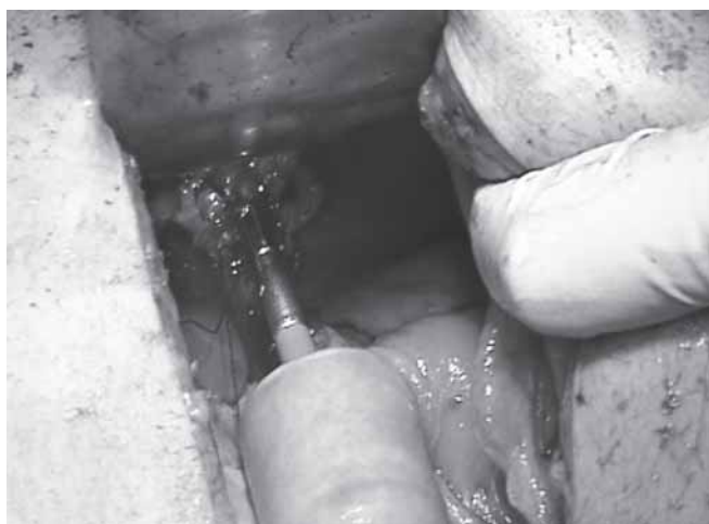
Fig. 6: Docking of anvil into circular stapler