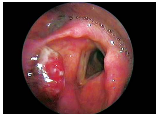
Fig. 1: Preoperative video laryngoscopy showing a red, lobulated mass in the right aryepiglottic fold

Laryngeal paragangliomas are uncommonly reported lesions especially among males. Endoscopic excisions have resulted