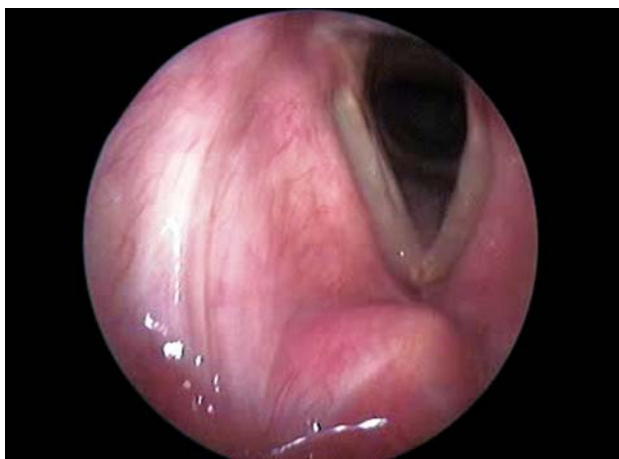
Fig. 4: Video laryngoscopy at 1 year showing well-healed scar with no recurrence

in recurrences on follow-up. 3 Open surgical procedures like thyrotomy and pharyngotomy ensure complete removal and minimize recurrences. This case is being reported for its rarity of occurrence that too in a male patient, with repeated