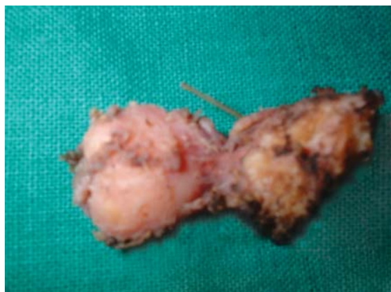
Fig. 2C: Lesion after excision

surgical intervention and clinicopathological correlation helped us in the optimal and successful management. An extensive review of literature did not reveal any other similar case and we believe this to be the first case report of a tuberculous RLN granuloma.