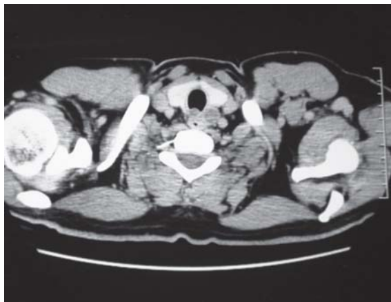
Fig. 1: CT scan of the root of neck and chest showing the lesion