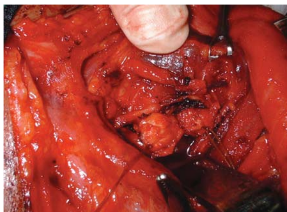
Fig. 2B: Nodular mass separated from RLN with difficulty