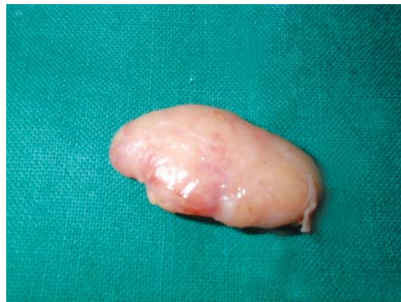
Fig. 3: Excised level 2 node