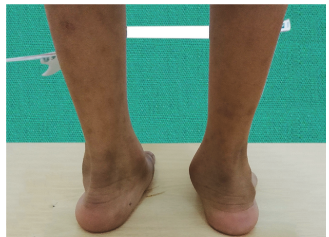
Fig. 2: Clinical photograph showing heel in valgus and collapsed medial arch