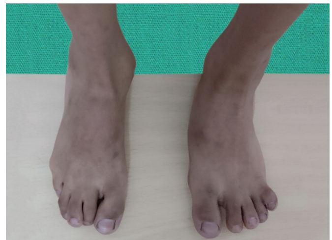
Fig. 1: Clinical photograph showing splaying of toes and abduction of forefoot

deformity of the left foot of the child. His both feet were normal at birth, and the deformity was noticed by parents only a year back. The deformity has slowly become more evident over the last one year. The child did not complain of any pain in the foot at any point in time. There was no history of trauma. The gait was normal and no difference was seen at a different speed of walking. On inspection of the left foot, the heel was in valgus (Fig. 1), medial arch appeared to have collapsed, the toes were splayed, and forefoot was in abduction due to which the lateral border appeared concave outwards (Figs 1 and 2). On physical examination, the deformity was correctable. No tenderness or signs of inflammation were present.