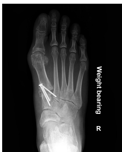
Fig. 1: X-ray of post Lapidus procedure with plate osteosynthesis

Statistical analysis was carried out using SPSS® 19.0 (IBM, Armonk, New York, United States). Statistical significance was defined as a p-value of \leq 0.05 . The Student's paired t-test was used to analyze the improvement in VAS and AOFAS scores in both the plate osteosynthesis and screw fixation group.