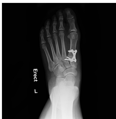
Fig. 2: X-ray of post Lapidus procedure with screw fixation