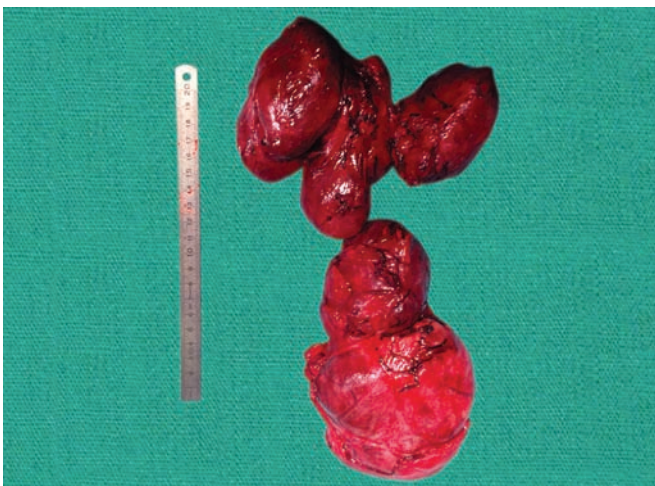
Fig. 3. The removed goiter weighing 940 grams.

Data suggest that 5 to 10% of operations for SSGs are due to recurrent or persistent goiters, and the most common initial procedures appear to be subtotal thyroidectomy and hemithyroidectomy. 1 This patient had previously undergone a subtotal thyroidectomy. There is a continuous debate regarding the surgical management of bilateral benign multinodular goiters. With subtotal resection, the incidence of RLN palsy and hypoparathyroidism decreases, on the other hand, the risk of recurrent or persistent disease increases. 9 The patient in this