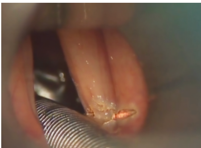
Fig. 3: Incision for laser-assisted cordotomy.