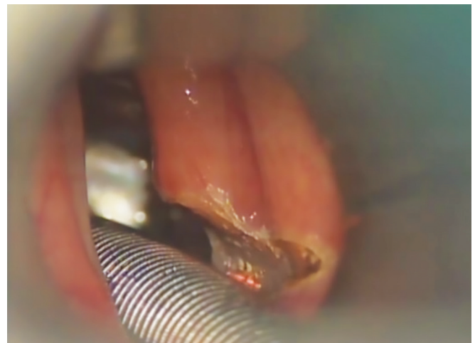
Fig. 4: Laser-assisted cordotomy completed.