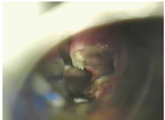
Fig. 2: Coblator-assisted cordectomy completed.