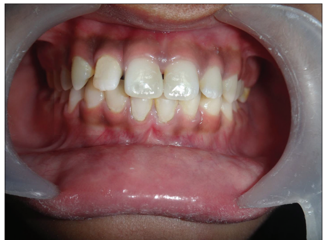
Figure 3: Post-operative photograph (polycarbonate crown on 11 and fractured coronal segments of 12 and 21 reattached)

dehydrate, color changes of the bonded fragment, and necessity for continuous monitoring. [1]