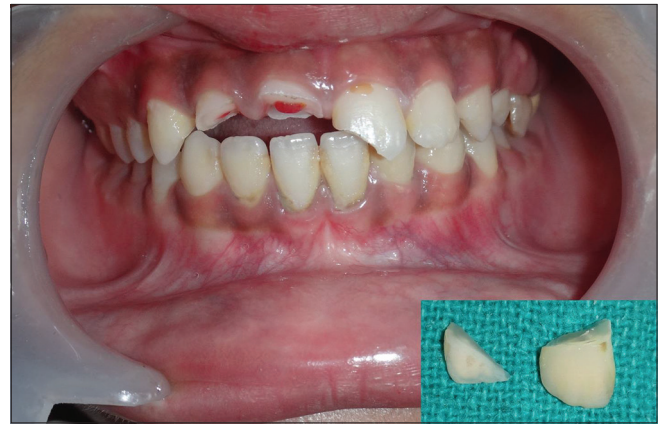
Figure 1: Pre-operative photograph and fractured coronal segments of 12 and 21