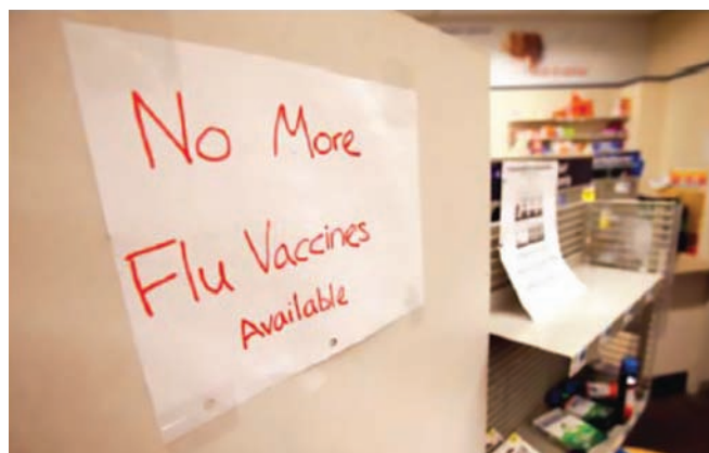
Fig. 1: Over reporting of flu by Google

Apart from Google, there are various sources of information as is depicted in (Fig. 2). In fact, in July 2015, FDA has agreed to share information with Google and other web-based portals about using data mining to identify unknown drug side effects been reported at these sites.