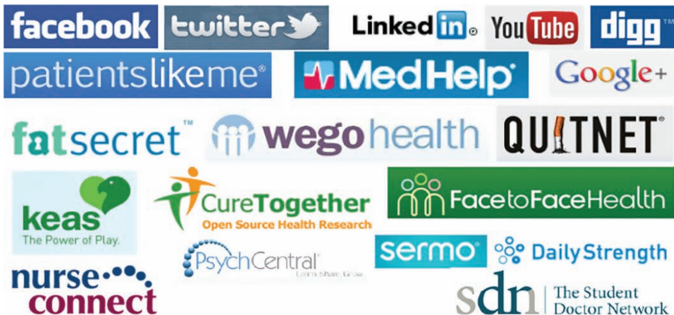
Fig. 2: Various sources of information for data mining.