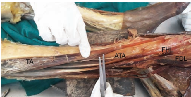
Fig. 3: Anterolateral view of right leg showing anterior tibial artery (ATA) terminating as a minute twig at the ankle joint. TA, tibialis anterior; flexor hallucis longus (FHL); flexor digitorum longus (FDL)

longus where it ended 6 cm above the ankle-joint (0.14 mm) (Fig. 3). The peroneal artery pierced the lowest portion of the interosseous membrane and continued as DPA (Fig. 4).