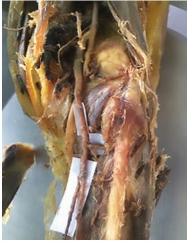
Fig. 1: Right view of popliteal fossa showing popliteal artery (PA) dividing into anterior tibial artery (ATA) and posterior tibial artery (PTA) with posterior tibial artery (PTA) giving rise to peroneal artery (PA)