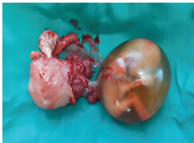
Fig. 2: Resected specimen showing rudimentary horn with sac with the fetus and ipsilateral tube and ovary