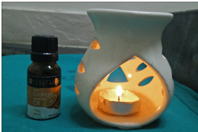
Figure 2: Orange essential oil and diffuser used.