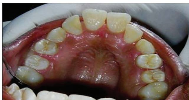
Figure 3: Post-operative photograph