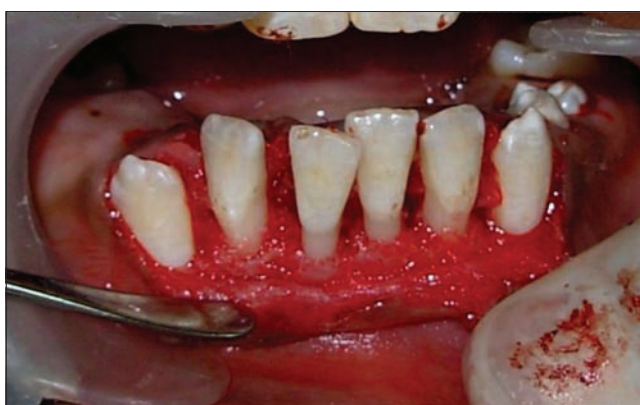
Figure 2: Flap raised