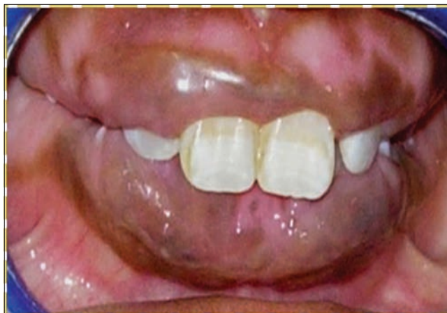
Figure 1: Pre-operative photograph

The diagnosis of idiopathic gingival fibromatosis was made based on patients' medical and family history,