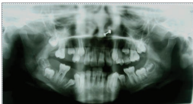
Figure 5: Orthopantomogram