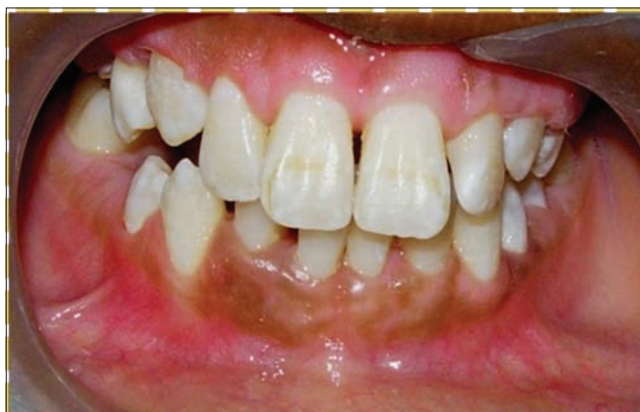
Figure 4: Post-operative photograph