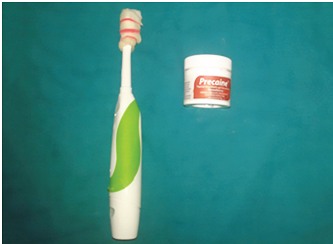
Fig. 1: Rajasthan University of Health Science mucosal vibrator