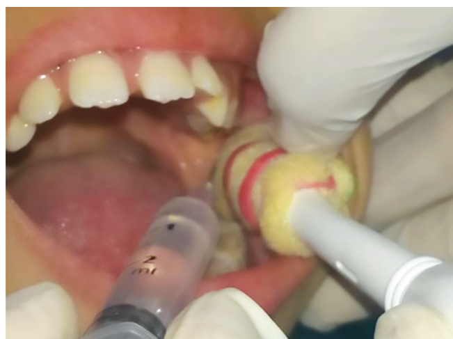
Fig. 3: Administration of local anesthetic with RUHS mucosal vibrator

approved by the Medical Research Ethical Committee of Rajasthan College of Dental Sciences, Jaipur. In the first appointment, the injection site was isolated using cotton roll and the topical Precaine (8% lignocaine and 0.8% dibucaine) (Pascal International™) anesthetic gel was applied using sterile cotton dipped applicator for 30 seconds to the injection site (Fig. 2) and left for 3 to 5 minutes after informing the child, then 1.5 mL of local anesthetic solution was deposited (1 mL/min) using a 24 gauge sterile hypodermic syringe needle and the dental treatment was carried out. In the subsequent appointment after 4 to 5 days on the contralateral side of the same arch, after tell-show-do technique, RUHS mucosal vibrator was applied before and during the local anesthetic administration to the injection site for 1 minute. The local anesthesia was administered by keeping the needle in close vicinity to the vibrator and the vibration continued for 15 seconds after the removal of the needle. It had a massaging effect and helped in the dissipation of the local anesthetic solution (Fig. 3).