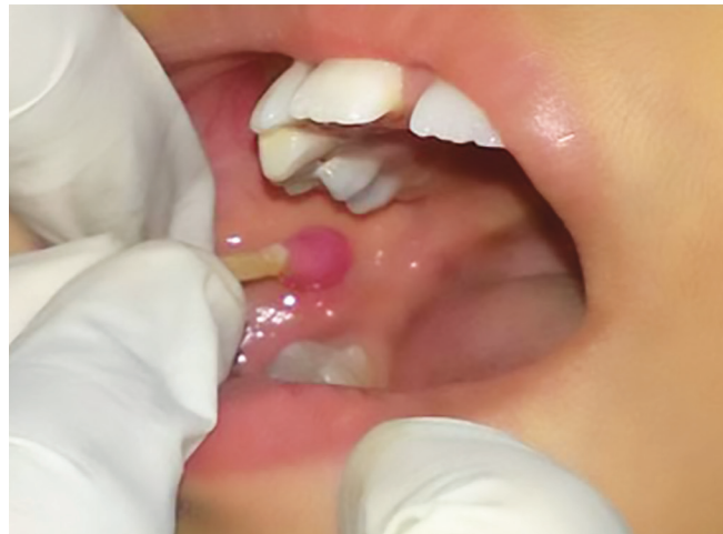
Fig. 2: Topical anesthetic application

vibration as a counterstimulation and in a sustained frequency onto the site of injection. 3 Implementing the same concept of vibration, we have used Colgate 360° Total Advanced sonic-powered toothbrush for mucosal vibration. Bristles of the brush were covered with soft sponge with a frequency of 20,000 strokes/minute vibrations and named it as Rajasthan University of Health Science (RUHS) mucosal vibrator (Fig. 1). Mechanism of action is the same as that of Dental Vibe. Mucosal vibrator decreases patient anxiety in case the patient is afraid of injection. The soft sponge over bristles has a massaging effect which helps in dissolution of solution faster and a soothing effect. The present study was thus conducted to compare the effectiveness of mucosal vibrator with lidocaine topical anesthetic gel during local anesthetic administration.