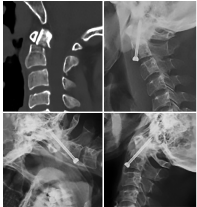
Fig. 2: 34-year old male with a posteriorly displaced type II odontoid fracture. (a) Preoperative CT sagittal images showing the displaced fracture. This patient underwent an anterior odontoid screw fixation and the immediate postoperative lateral radiograph showed good reduction of the fracture (b). 3-year follow-up lateral radiographs show the anterior odontoid screw in situ and bony fusion, with no evidence of instability on flexion (c) or extension (d) images.

fusion alone was performed in the remaining 8 patients, using C1-C2 transarticular screw fixation ( n = 5 ) (Fig 3.), C1-C2 lateral mass screws ( n = 1 ), occipito-cervical fusion ( n = 1 ) or a C1-2 modified Brook's fusion ( n = 1 ) (Fig 4.). Iliac crest autograft was used in all patients for fusion.