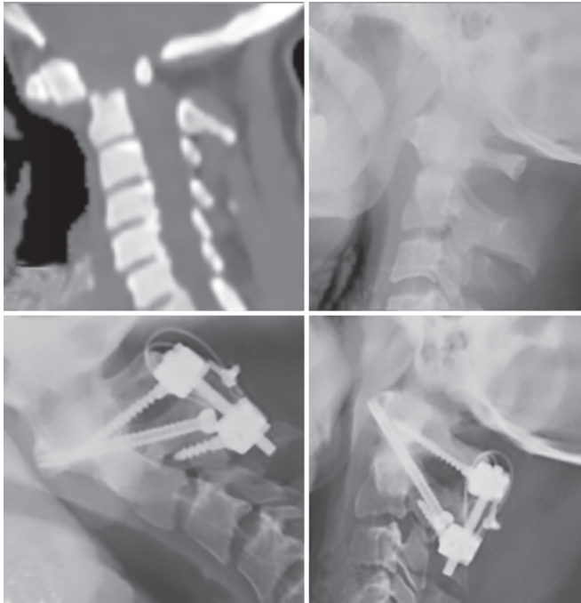
Fig. 3: 49-year old male with a completely displaced type II odontoid fracture (a) that reduced on traction (b). He underwent a C1-2 left transarticular screw insertion and right C1, C2 lateral mass screw fixation. 1 year follow-up lateral radiographs (c) flexion, (d) extension show bony fusion and no instability.

develop any new neurological deficits and were ASIA grade E at presentation and on last follow-up. There was no mortality in our series.