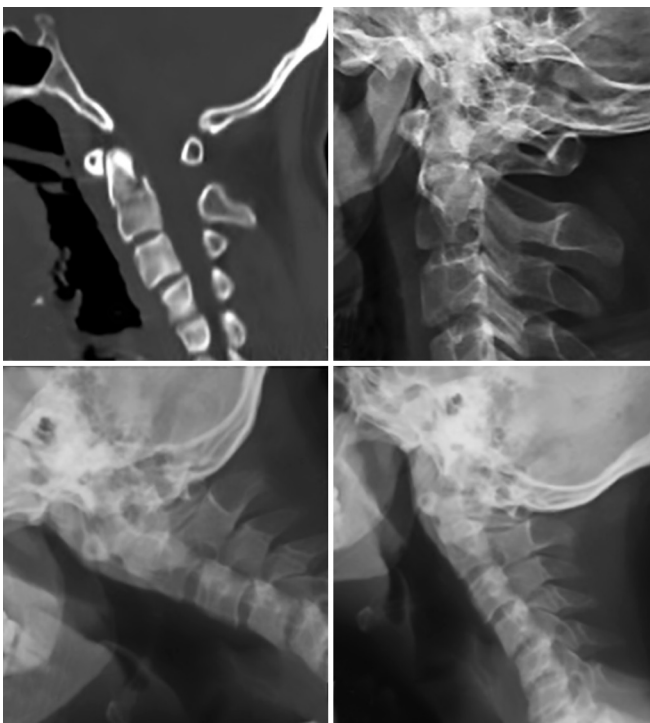
Fig. 1: 32-year old male with a Type III odontoid fracture (a,b) managed with Halo-fixation. On a 6-month follow-up, there is evidence of bony fusion and no instability on the flexion (c) and extension (d) imaging.

Eight patients underwent an anterior odontoid screw fixation (Fig 2). This was done typically in patients who had an anterior displacement of the dens; although one patient out of these had a posterior displacement of nearly 4 mm. Four patients underwent a transoral odontoidectomy and C2 median corpectomy, followed by either occipito-cervical fusion or C1-C2 lateral mass fusion. All of these 4 patients had spondyloptosis of the fractured dens, which did not reduce adequately on traction and when positioned for surgery under GA. Three out of these had anteriorly displaced dens, and the mean displacement ( n = 4 ) was 11.1 mm (range, 7-15 mm). Posterior