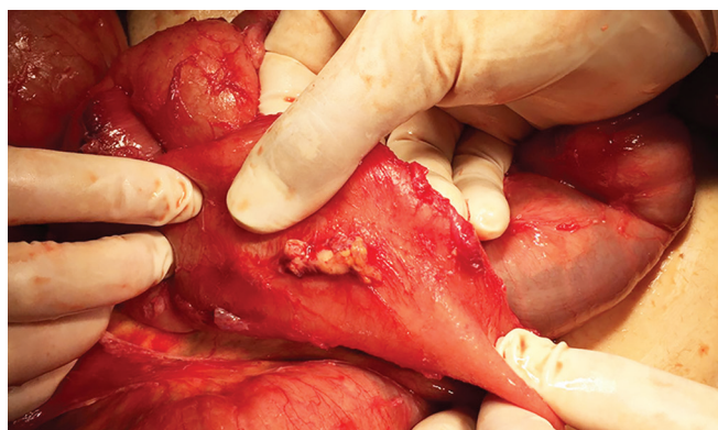
Fig. 2: Small mass of approximately 2 cm, firmly adhered to the parietal peritoneum.