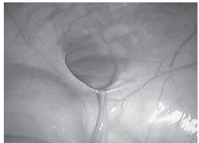
Fig. 1: Right inguinal hernia defect

Patient was given general anesthesia with endotracheal tube intubation and pneumoperitoneum was created with the help of Veress needle maintaining a pressure of 8 to 10 mm Hg. Trocar was introduced through lower aspect of the umbilicus for camera and abdomen inspected from inside. A defect of approximately 2 cm was found on the right side lateral to the inferior epigastric artery and left internal ring was obliterated. Percutaneous purse string suturing of the right internal ring was done under vision extraperitoneally with the help of needle and a nonabsorbable 2/0 suture (Figs 1 to 3).