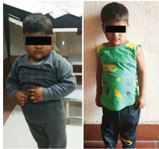
Fig. 1: Preoperative and postoperative clinical image

Adrenal tumors are extremely rare in childhood except in Brazil, 1,2 so that their clinical manifestations remain poorly known by pediatricians. In adults, adrenal tumors often are revealed by Cushing syndrome, with evidence of glucocorticoid secretion in two-thirds of patients. 3,4 These tumors are often large at diagnosis and are already metastatic in 22 to 50% of patients. In children, the most common manifestation of adrenal tumors is the appearance of pubic hair and other signs of virilization (Fig. 1). Isolated androgen secretion is present in 40% of children's tumors vs 9% in adults. The high frequency of virilization should further accelerate the diagnosis, provided that pediatricians systematically use ultrasound and computed tomography (CT) scanning to image adrenals in children of both sexes who present with any androgenic manifestation, even as mild as pubic hair. Also, if children suddenly get obese, particularly those with peripheral precocious puberty, they should be screened for ACTs. The laboratory characteristics of ACTs are the discordantly elevated