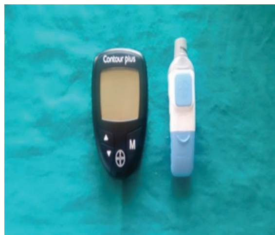
Fig. 2: Glucometer