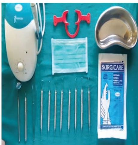
Fig. 1: Armamentarium