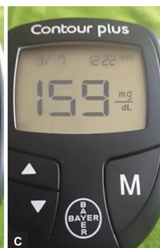
Figs 4A to C: Measurement of finger papillary blood glucose level