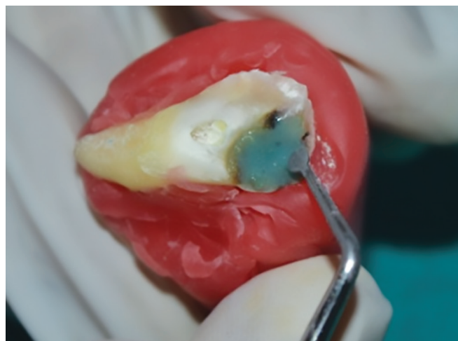
Fig. 2: Excavating the caries after placing chemomechanical caries removal agent using a spoon excavator

Fifteen samples from each group were built up using three layers of a posterior resin-based composite (Filtek Z350, 3M) to a height of approximately 5 mm using total etch adhesive system (single bond, 3M). Specimens