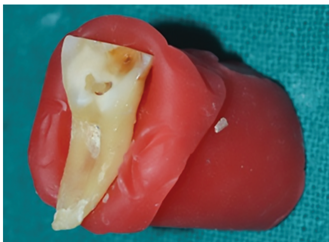
Fig. 3: Caries-affected dentin left after caries excavation

were then stored in water at 37°C for 24 hours. The teeth were then individually fixed to a sectioning block using acrylic resin. Using hard tissue microtome 1 mm thick sections containing bonded caries-affected dentin specimens were obtained from each tooth depending on the size of caries lesion. The slices were then trimmed and shaped to form a gentle curve along the adhesive interface from both sides using superfine diamond burs to obtain a rectangular cross-sectional shape with the surface area of approximately 1 mm 2 . The beams were then attached to a custom-made jig and were attached to the Instron universal testing machine. A tensile load was applied at a cross-head speed of 0.5 mm/min until the beam fractured, and the load at which the fracture occurred was recorded.