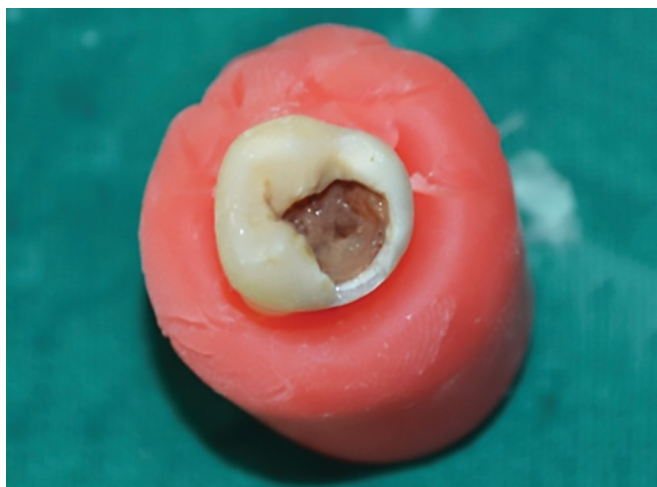
Fig. 1: Extracted molars with coronal caries

The aim of the study is to evaluate the microtensile bond strength of teeth restored with packable composite after removing caries with three chemomechanical caries removal agents (Carisolv, Papacarie, and Carie-care) and also to analyze its effect on the chemical composition of dentin using EDX analysis and compare it with traditional technique of using bur to remove caries.