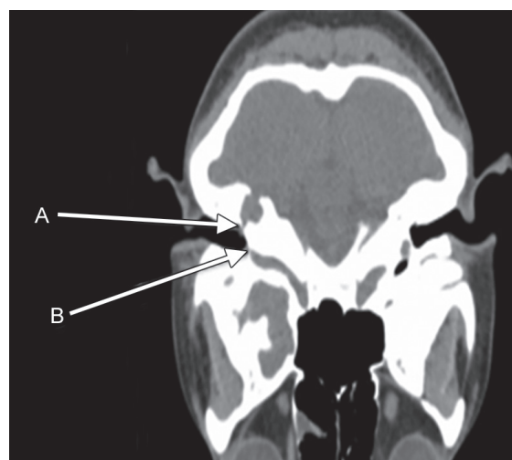
Figs 1A and B: (A) Dehiscent anterior wall of right tympanic cavity showing exposed internal carotid artery. (B) Dehiscent right posterior and inferior wall of tympanic cavity showing enlarged jugular bulb

A high-resolution computed tomography of temporal bone and magnetic resonance scan of brain and temporal bone was performed, which revealed a dehiscent right carotid canal and an enlarged right-sided jugular bulb with dehiscence of the anterior bony wall of right jugular fossa (Figs 1 and 2). There was a 4 mm rounded soft