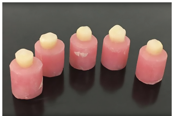
Fig. 1: Acrylic cylindrical denture base specimens with acrylic premolar teeth after surface conditioning treatment

Subgroups II and II1: Surface conditioning of the ridge lap area of acrylic denture with acrylic adhesive