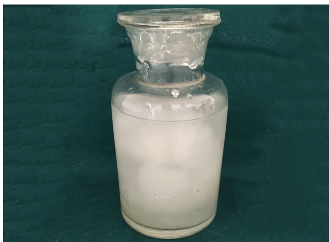
Fig. 1: Aloe vera extract

water, serial dilutions of 5/95, 25/75, 50/50, and 100 mL (volume/volume) were made in order to obtain 5, 25, 50, and 100% concentrations respectively, for the evaluation of antimicrobial activity against E. faecalis . The antimicrobial testing was done on the same day of extracts prepared.