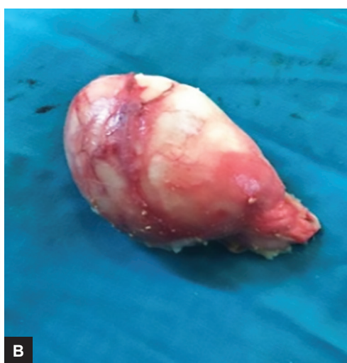
Figs 4A and B: Intraoperative pictures

smooth round borders in submandibular region with mixed attenuation and scattered calcifications, extending to the opposite side suggestive of ranula (Fig. 3).