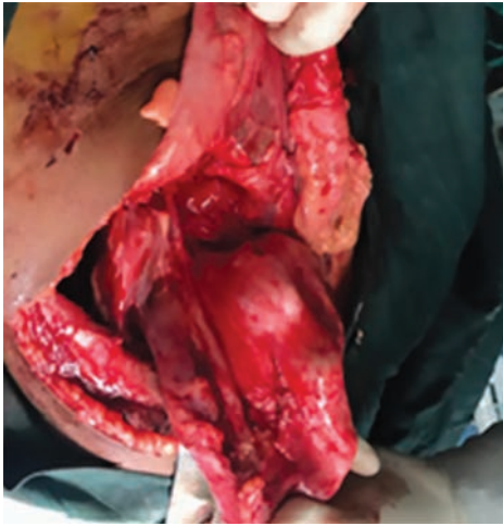
Fig. 2: Dermoid cyst arising from pancreatic tail region