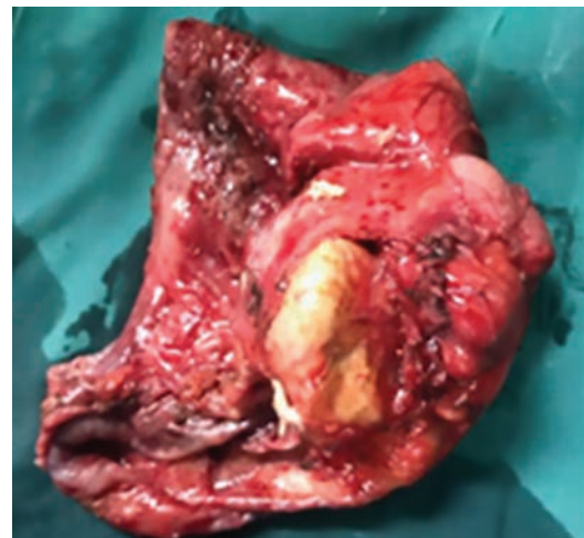
Fig. 5: Macroscopic view of the dermoid cyst

The mass was excised in toto . Its cut surface showed pultaceous material, hair, bone, and areas of hemorrhage (Figs 4 and 5). On microscopic examination, cyst wall was lined with stratified squamous epithelium with keratin flakes. Adipose tissue, cartilage, and bony trabeculae were also seen.