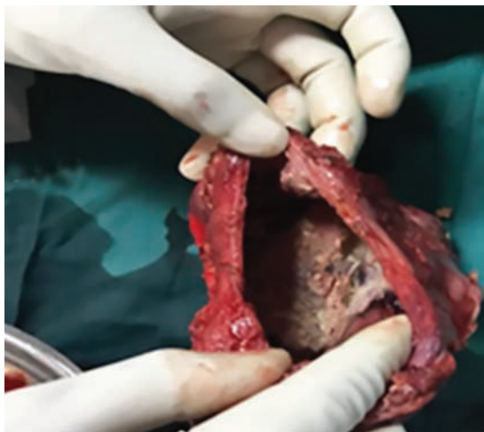
Fig. 4: Surgical specimen shows that the cyst is filled with finely granular, grayish white, keratinaceous, and sebaceous material