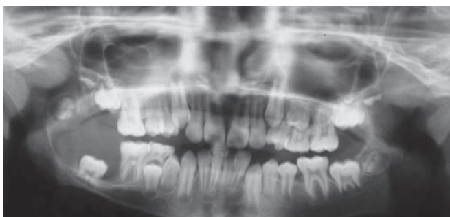
Fig. 3: Panoramic radiograph showing a pericoronal radiolucency associated with the crown of unerupted 47