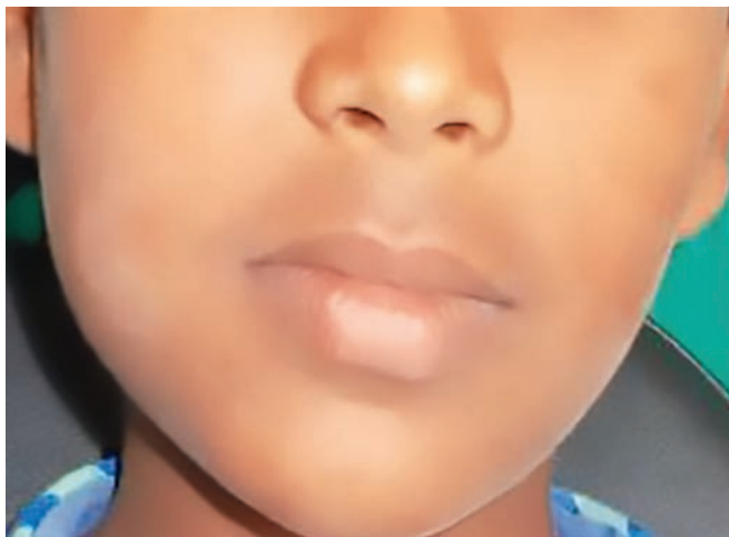
Fig. 1: Clinical picture of extraoral swelling on the right side of face