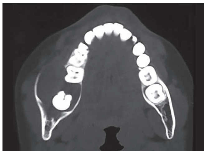
Fig. 4: Computed tomography scan showing the buccal and lingual cortical expansion with perforation on the buccal aspect

Showing the anterioposterior and superoinferior extension of the lesion region of 46 to the midpart of ramus of mandible and superoinferiorly from tooth bud of 48 till cemento enamel junction of unerupted 47. It was a unilocular radiolucency with ill-defined septae and corticated borders; 47 was pushed inferiorly and tooth bud 48 was pushed superiorly 2 cm below the sigmoid notch. No other pathological radiolucencies were evident on the contralateral side (Fig. 3). Dentigerous cyst, solid ameloblastoma, intraoral tumor, and soft tissue sarcoma were considered as radiographic provisional diagnosis. Fine needle aspiration cytology was done, which showed inflammatory cells. Computed tomography (CT) scan also showed the buccal and lingual cortical expansion with perforation on the buccal aspect (Fig. 4). Patient underwent scalpel excision under general anesthesia following strict aseptic conditions. Epithelial lining was identified and curetted out. 47 and tooth bud of 48 were extracted. Since the clinical presentation of lesion looked aggressive, Carnoy's solution was applied according to standard protocols. The specimen was sent for histopathology which revealed cystic lumen lined by 2 to 5 layered nonkeratinized stratified squamous epithelium, at places showing hyperplasia. Capsular tissue was dense to delicate, resembling primitive connective tissue stroma