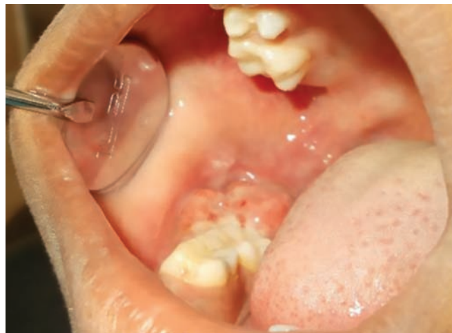
Fig. 2: Intraoral picture showing swelling distal to 46