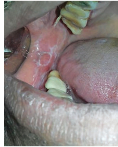
Fig. 2: Lesion on cheek mucosa