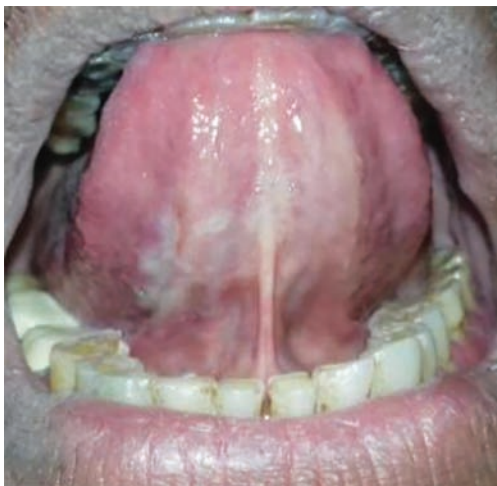
Fig. 3: Lesion on ventral aspect of tongue