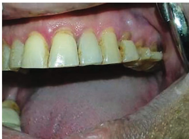
Fig. 9: Regression of lesion on buccal aspect of gingiva

the causative and exacerbating factors for OLP and lichenoid reactions, such as drugs like antimalarial, diuretics, antiretroviral, dental materials like dental amalgam, composite, resin-based materials, metals, chronic liver disease, hepatitis C virus, genetics, and tobacco chewing. In our case, there was no such situation that could have provoked OLP reactions.