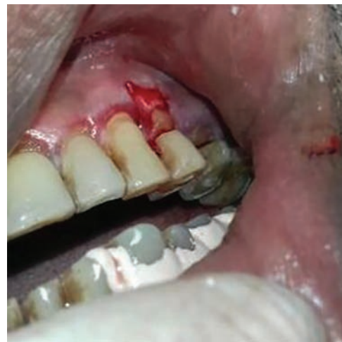
Fig. 4: Biopsy specimen from the buccal side of maxillary premolar region

involving marginal and attached gingiva as well as on the mucosa of the cheek (Fig. 2). The lesion was also seen involving dorsal and ventral aspect of the tongue (Fig. 3). Anteroposteriorly, the lesion extended from occlusal level of molars to the retromolar area. Superoinferiorly, it extended up to the buccal vestibule. The lesion on palpation was tender and nonscrapable. The patient had generalized attrition of teeth and had porcelain fused to ceramic crowns placed in relation to 46 and 47. The patient had cervical abrasions in relation to 21, 23, 24, 25, and 26.