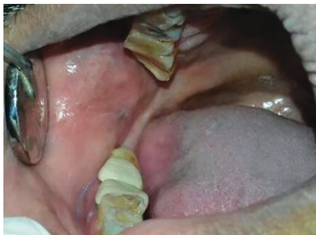
Fig. 6: Regression of lesion on cheek mucosa

Histopathology revealed the section showing stratified squamous epithelium with areas of ortho- or parakeratosis, acanthosis, spongiosis, and hydropic degeneration of the basement layer which was separated from fibrocellular connective tissue. Sparse to moderate subepithelial band like inflammatory cell infiltrate chiefly is composed of lymphocytes and occasional plasma cells and arranged in a band-like pattern. Blood capillaries were also evident (Fig. 5). Based on clinical, radiographic, and histopathological findings, the final diagnosis was of reticular lichen planus on buccal mucosa and ventral surface of tongue, whereas atrophic lichen planus on gingiva was arrived.