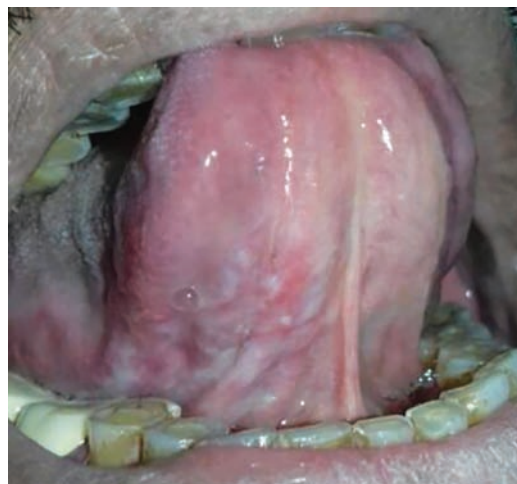
Fig. 8: Regression of the lesion on ventral aspect of tongue