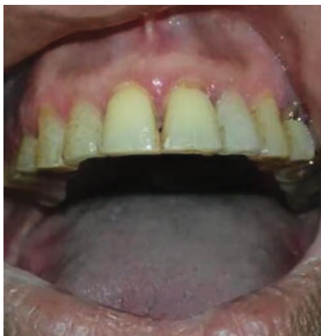
Fig. 7: Regression of lesion on gingiva

Lichen planus is a chronic autoimmune disease with an unknown etiology that is marked by invasion of lymphocytic infiltrate within the epithelial tissue inducing epithelial cell apoptosis and chronic inflammation. 11 The patient in this case report was a male of 62 years, which falls into the age range in which lichen planus is most commonly reported. The precise etiology of this condition is unknown, but, in their review, Ismail et al 12 reported