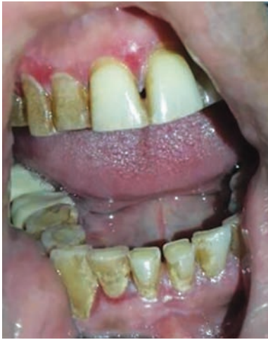
Fig. 1: Lesion on upper and lower buccal gingiva