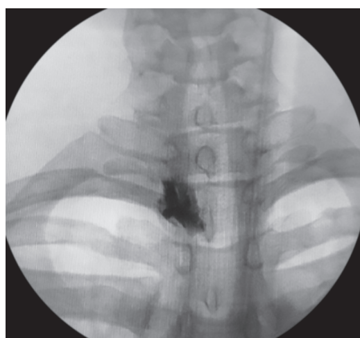
Fig. 2: Stellate ganglion block

and equal volumes of 0.5% injection Bupivacaine. This was immediately followed by an injection of a mixture of injection Lignocaine 1% (5 mL) plus injection Bupivacaine 0.25% (5 mL) into right stellate ganglion. The patient had signs and symptoms of Horner's syndrome, such as pin point right pupil and hoarseness of voice for a few hours. Otherwise, both the procedures were uneventful.