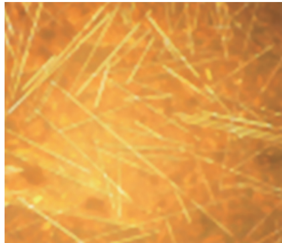
Fig. 2: Microscopic image of EverX posterior showing fiber length extending to the length of 1 mm and up to 2 mm

Microscopic image of everX Posterior showed fiber length extending to the range of 1 mm and up to 2 mm. In the present study, the majority of fractures, with everX Posterior bulk-fill composites were type II, i.e., they were defined as restorable which is in contrast with the study results of Yasa et al 15 and Toz et al. 30