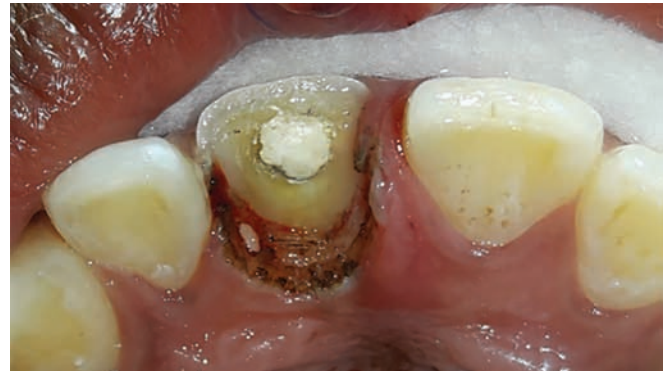
Fig. 4: After laser gingivectomy

The fractured segment was moderately mobile and remained attached to the rest of the tooth (Fig. 1).