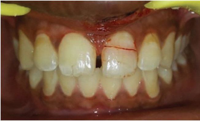
Fig. 1: Preoperative photograph