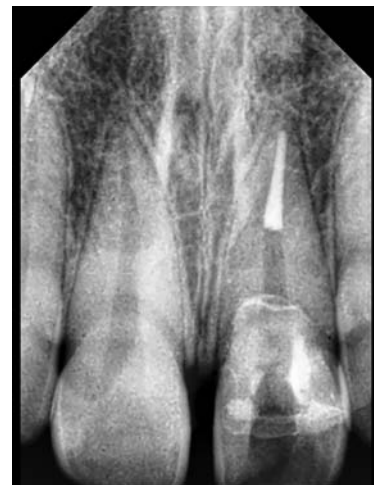
Fig. 5: Post space preparation

The pulp was extirpated and working length radiograph was taken. Cleaning, shaping, and obturation were done in a single visit in relation to 21. Laser gingivectomy was done in the palatal aspect of 21 to expose the margin (Fig. 4). The detached segment was reattached using resin cement, and gutta-percha was removed using heated hand plugger until an apical 5 mm of gutta-percha was