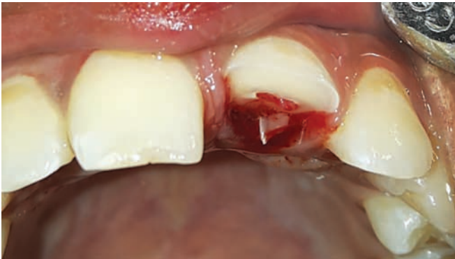
Fig. 3: After fractured segment detachment