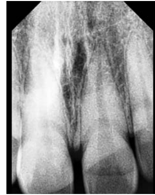
Fig. 2: Preoperative radiograph