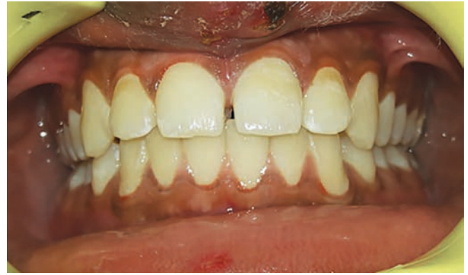
Fig. 7: Postoperative photograph